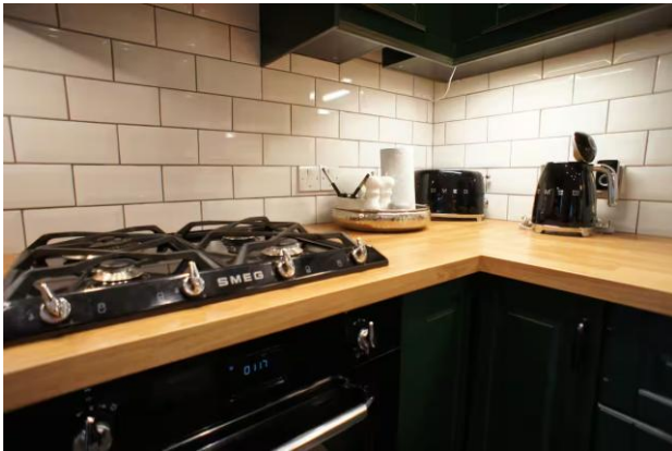
Kitchen – elegant kitchen with high quality equipment