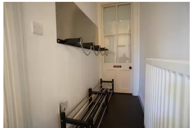
Golf Club Storage – bespoke storage for up to four sets of clubs