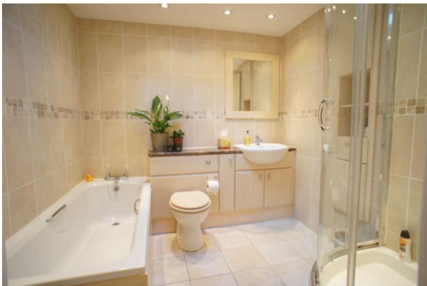
Family bathroom - full-size bath and separate glass shower enclosure