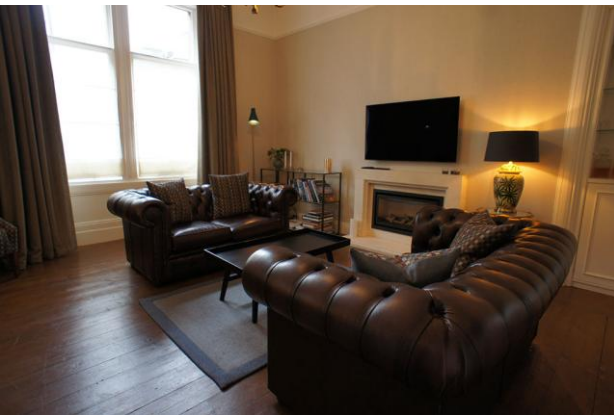
Lounge – elegant proportions with original features and ambient lighting