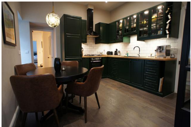
Kitchen & dining – stylish dark green fitted kitchen with round dining table for four