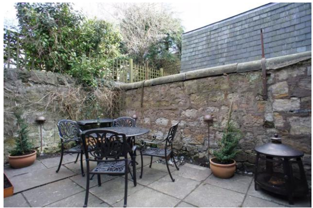
Garden – private courtyard with seating for four