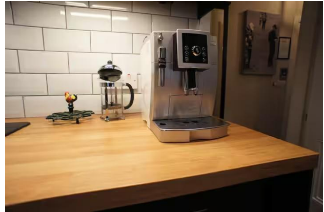
Kitchen – range of coffee making options, ideal for those early starts