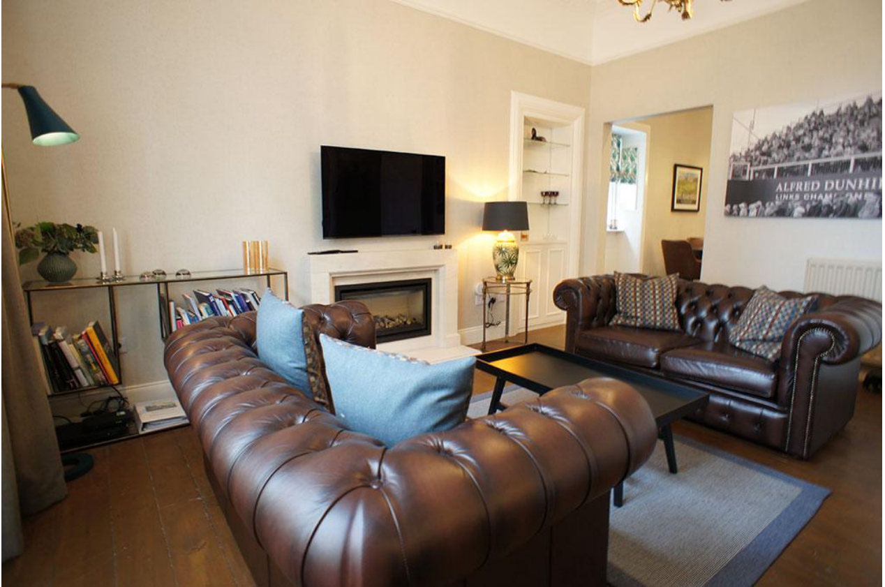
Drawing room - grand Chesterfield lounge with period cornicing, gas fire and large flat-screen TV