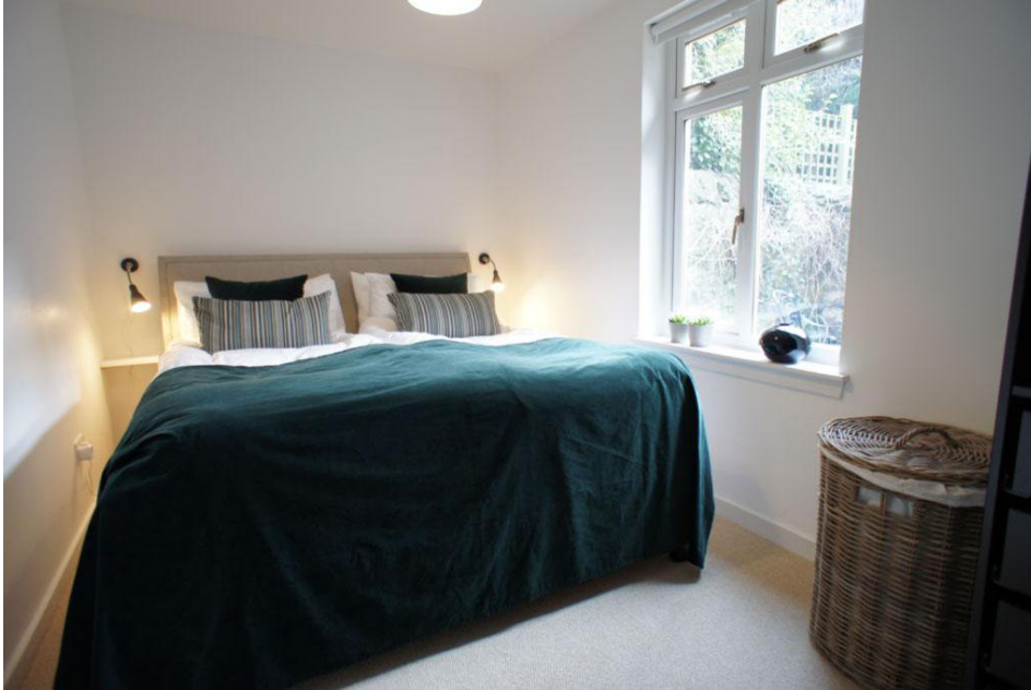
Bedroom 1 – Double room with Double bed and storage