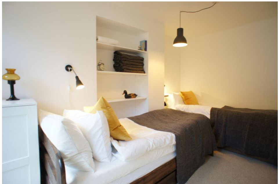
Bedroom 2 – with two single beds and storage